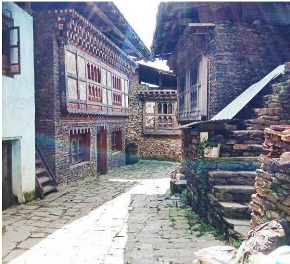
Figure 2. The exact locality where Nanorana gammii was observed, Zhemgang, Central Bhutan

presence of other individuals by the second and third authors who did not find any more that year as they may already have hibernated. A live specimen (Fig. 3A) was collected on 1 September 2020 at 16:00 h near a home garden in suburb of Zhemgang (27.215793°N, 90.658101°E, alt. 1,881 m a.s.l.; Fig. 2). Despite our efforts to find additional specimens, none were recorded likely due to the cold weather with the approach of winter in the area. The new locality is ~240 km air distance from the type locality of N. gammii in the Darjeeling Hills, West Bengal, India.