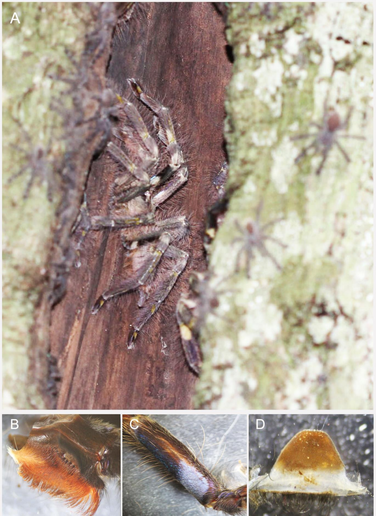
Figure 2. Poecilotheria rufilata : (A) a female in the retreat; (B) maxillae showing stridulating organ; (C) femur of leg I; (D) spermatheca (not to scale).