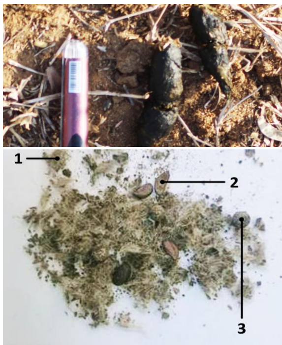
Figure 2. (A) Scats and (B) prey remains of Indian fox in the study area: (1) hair and seeds of (2) Diospyros montana and (3) Ziziphus sp.; scale: 1 cm.

items in the scats. The occurrence of D. montana seeds in Indian fox scats has not been previously reported. Six of the 56 scats that we collected contained the seeds of D. montana along with Ziziphus seeds. We also noticed a high density of D. montana plants in the study area in winter. During late-winter and summer, we found more animal matter such as bones, hair and arthropod body parts. The simple Chi-square test shows that there is significant difference between the consumption of animal matter in the wet season and plant matter in the dry season ( n=56 , \chi^2=21.1 , p=0.0008 ). Overall, we found arthropods to be a major diet item of the Indian fox, which is similar to previous studies (Vanak 2003, Home 2005, Dookia et al. 2012). However, birds were not reported in the study conducted by Home (2005). During the monsoon and early-winter, the Indian fox becomes more frugivorous due to the high availability of fruit, as is also reported for the red fox, Vulpes vulpes (Cavallini & Lovari 1991). This study also showed that the diet of omnivorous and generalist animals may have some relationship with meteorological factors, which might be useful as an indicator of climate change if studied for longer periods of time.