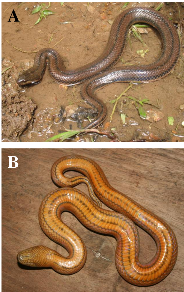
Figure 2: Enhydris dussumierii in life (A) dorsal, (B) ventral views

bordered, thus demarcating the ventrals on the sides; iris fawn brown; pupil dark, small, rounded.