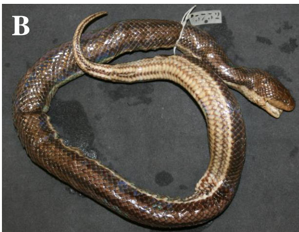
Figure 1: Syntypes of Enhydris dussumierii ; (A) MNHN 3751, (B) MNHN 3752.

Despite Duméril et al. 's description in 1854 and the subsequent recognition by Jan (1868), some renowned treatises on Indian reptiles (Günther, 1864; Theobald, 1876; Boulenger, 1890) did not