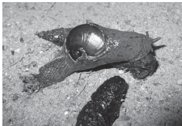
Fig. 02: R. irradians on the scats of Jackal

This is the first observation of E. carinata feeding on a land snail R. irradians . Further investigation is needed to establish if R. irradians is a regular item of the diet of E. carinata and to clarify what R. irradians feeds when on Jackal scats. Data on the diet and feeding habits of Sri Lankan and South Asian land snails or skinks are sparse and further observations are needed to verify their feeding habits. It is interesting to examine food and feeding habits of E. carinata on its range especially in