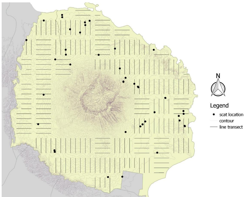
Figure 1: Map of study area in the Baluran National Park; dots represent the distribution of dhole's scats and lines represent the distribution of line transects.

phenomenon not reported for sympatric domestic dogs or Asiatic jackals ( Canis aureus ) (Cohen et al. , 1978), and the scat identification was confirmed by their distinctive odor, appearance and presence of dhole tracks near the collection site (Cohen et al. , 1978; Johnsingh, 1992; Karanth & Sunquist, 1995; Selvan et al. , 2013b). Once scats were found, they were collected and stored in an airtight plastic bag (Selvan et al. , 2013a) and the locations of the scats were recorded using GPS Garmin 76 CSX. Only scats which were clearly identifiable were collected. As stated above, dholes hunt, feed, and defecate together in latrines (Johnsingh, 1982; Karanth & Sunquist, 1995; Durbin et al. , 2004; Thinley et al. , 2011; Kamler et al. , 2012), so that individual latrines contained scats that nearly always have the same content, suggesting they came from the same feeding event (Thinley et al. , 2011). Hence, as a general rule, only one scat from each latrine was collected to help ensure that scats were from independent feeding events (Kamler et al. , 2012). All feeding events which were opportunistically encountered during the fieldwork were also recorded.