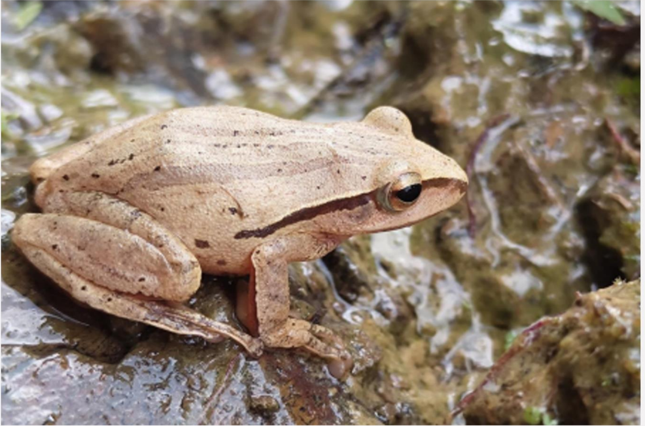
Figure 2. Polypedates braueri in life from Tungjoy in Senapati District of Manipur, India