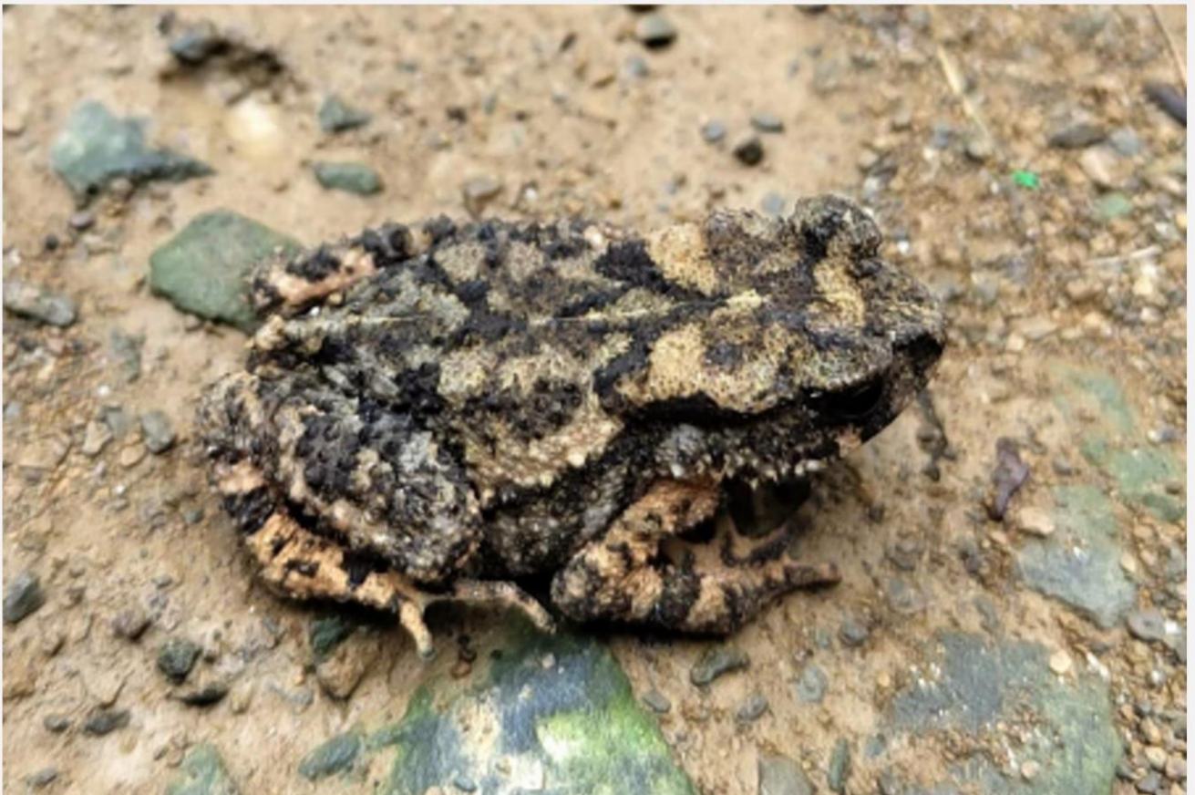
Figure 3. Duttaphrynus stuarti in life from Tungjoy in Senapati District of Manipur, India