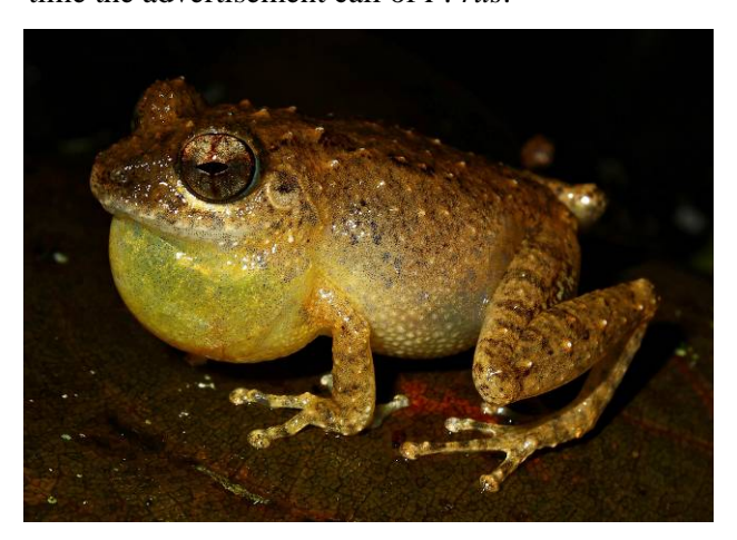
Figure 1: Pseudophilautus rus in Nawalapitiya

The Kandyan Shrub Frog, Pseudophilautus rus (Manamendra-Arachchi & Pethiyagoda, 2005) (Fig. 1) is known only from two localities around Kandy (500–800 m a.s.l), Sri Lanka; Kiribathkumbura and Pilimatalawa. Mature males attain a SVL of 20.6–24.1 mm and mature females up to 23.1 mm (Manamendra-Arachchi & Pethiyagoda, 2005). P. rus perches on low vegetation, usually on leaves and branches of shrubs, grass, and logs, 0.1–1.5 m above the ground. Males of the species produce one of the most frequently heard calls in suburban and urban areas in Kandy, together with the common shrub frog P. popularis . Here, I describe for the first time the advertisement call of P. rus .