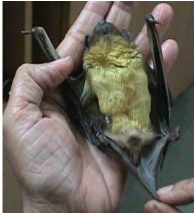
Figure 9: Scotophilus heathii

Pune; Deoghar-poladpur; Khed Shivapur; Karjat-Raigad (Gaikwad, 2007).