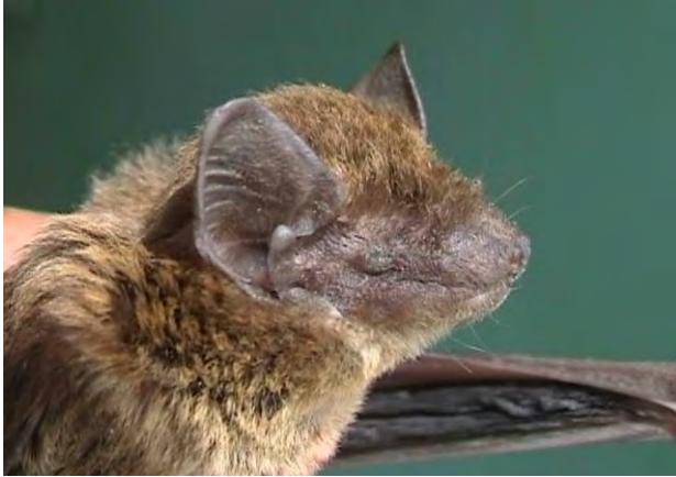
Figure 10: Pipistrellus kuhlii

Previous records from Maharashtra: Pune (Korad & Yardi, 1998-2000).