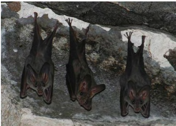
Figure 6: Megaderma lyra