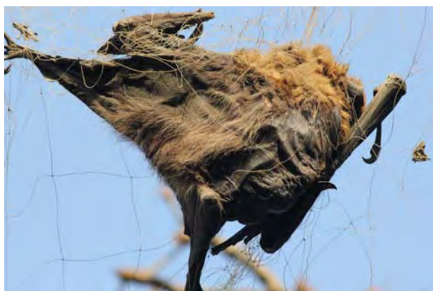
Figure 12: A bat trapped in nylon net at an orchard.

In the recent study it was observed that many old structures as houses, caves, temples were under renovation. Road ways construction, township projects, tourism, development of agricultural land removing natural vegetation etc. are also affecting bat fauna. Some mortality is due to trapping in nylon nets put around fruit crops such as vineyards. Thus it is important to study the impact of changing habitat and loss of suitable areas on survival of bats in the region (Jones et al. , 2009) with the help of a continuous bat monitoring programme. The uncontrolled use of chemical fertilizers and insecticides may have an effect on the food source of insectivorous bats. Pesticides may pose some detrimental effects on bat populations as seen in Clark et al. (1983). Extermination of colonies by pest control operators and Public Health Departments has also been responsible for the elimination of many bats in urban areas. We observed that availability of natural water was also one of the influential factors for distribution of bat species in the study area.