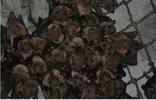
Figure 1: Rousettus leschenaultii

Fort, Junnar; Malshej Waterfall, Lonavala (Gaikwad, 2007).