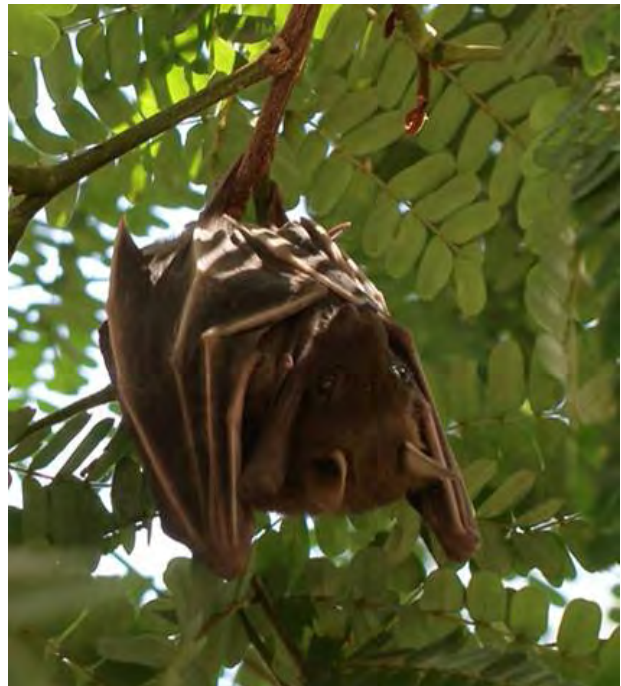
Figure 3: Cynopterus sphinx

This species is a small sized fruit bat with a short tail (half enclosed within the interfemoral membrane). Both the first and second fingers have distinct claws. Cynopterus sphinx has larger ears with paler anterior and posterior borders than its close relative C. brachyotis . This bat species was recorded from all over the study area and observed roosting at day time in groups of 4-20, mainly on trees like Ashoka ( Polyalthia longifolia ). In the late evening, bats were found in greater numbers, foraging on nearby fruiting trees. In some areas these bats were found dead on metal fences of vineyards.