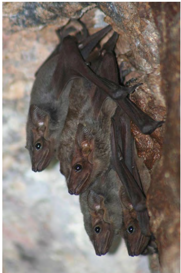
Figure 5: Taphozous longimanus