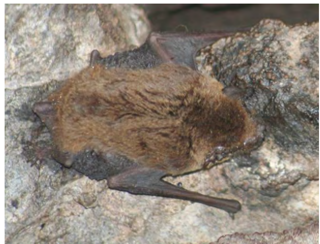
Figure 11: Hypsugo savii

Previous records from Maharashtra: Pune city (Korad & Yardi, 1998-2000); Bhaje caves; Mulshi, Pune (Gaikwad, 2007).