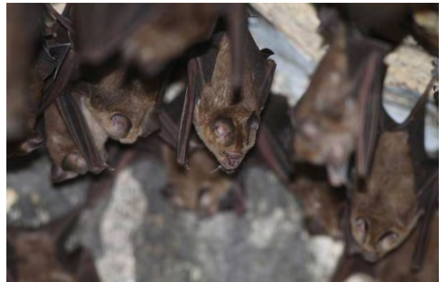
Figure 7: Hipposideros speoris