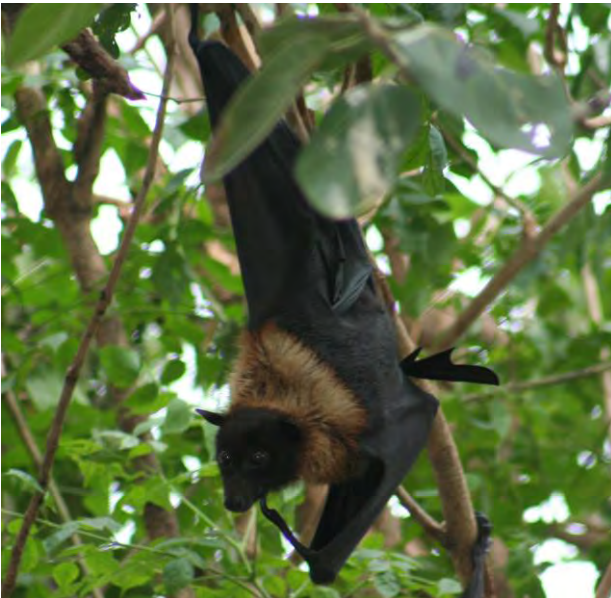
Figure 2: Pteropus giganteus

This species is a medium to large sized fruit bat without a tail. The patagium arises from sides of the dorsum and back of the 2 nd toe. Its ventral surface was pale tan to deep orange or chestnut brown. It is one of the common species in Maharashtra, but its roosting areas were not previously recorded from the study area. During our study we observed 16 colonies of P. giganteus , numbering between 100 and 500 individuals. Bat colonies were found roosting large old trees such as figs ( Ficus sp.), mango ( Mangifera indica ) and tamarind ( Tamarindus indica ). Flying foxes were observed dispersing several kilometres from their roosting site for foraging.