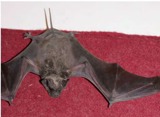
Figure 8: Tadarida aegyptiaca

Previous records from Maharashtra: Aurangabad (Brosset, 1962c); Pune (Brosset, 1962c, Korad & Yardi, 1998-2001); Khondai, Mulshi (Gaikwad, 2007).