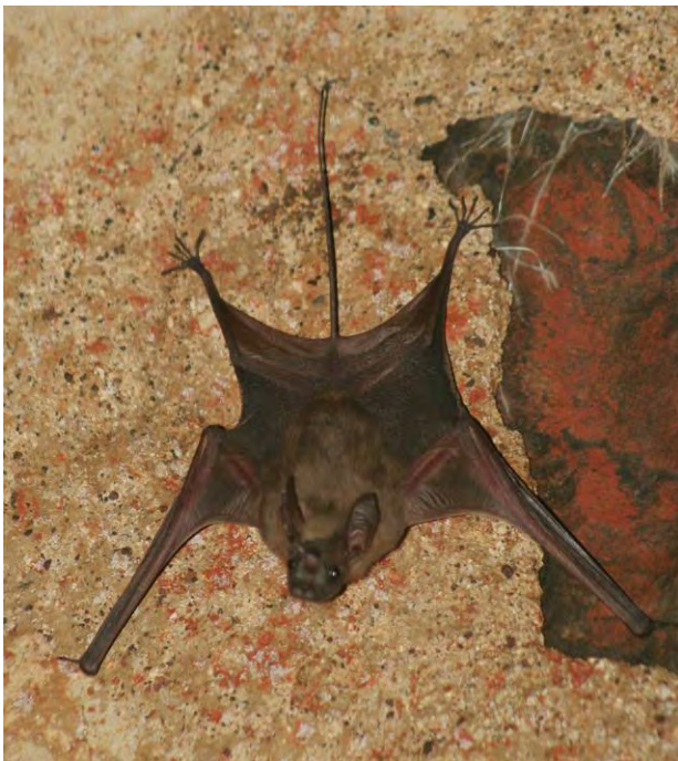
Figure 4: Rhinopoma microphyllum

Previous records from Maharashtra: Bombay (Hill, 1976); Nagpur (Sinha, 1970); Osmanabad; Songir, Bhamer (BMNH)