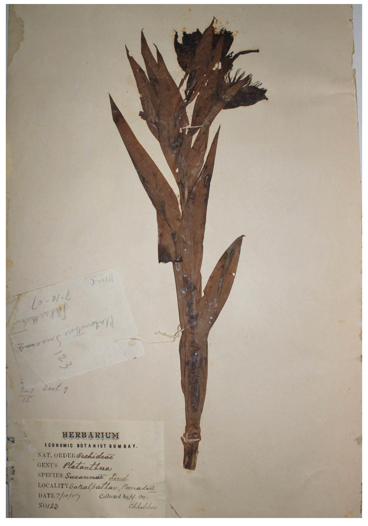
Figure 1 : Herbarium sheet of Platanthera susannae (family Orchidaceae).