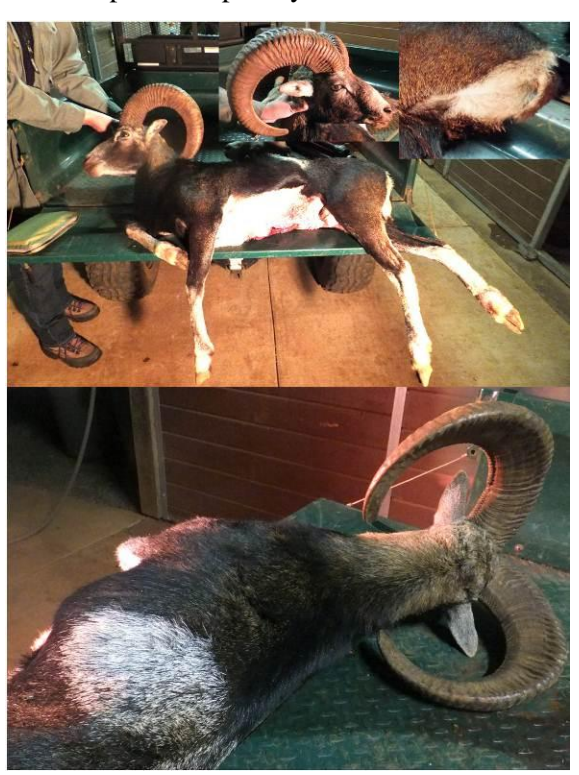
Figure 2: A typical mature ram from Lanai. Note the short "deer-like" tail (4.5 in), slight tendency of the horns to curve inward, white saddle patch-rump patch-underbelly-lower legs, and grayish non-drooping ears.

of wildlife resources on Lanai, and D. Campbell for his enduring commitment to wild sheep conservation. We are grateful to H. and Z. Brown and the Fisher family for their friendship and hospitality.