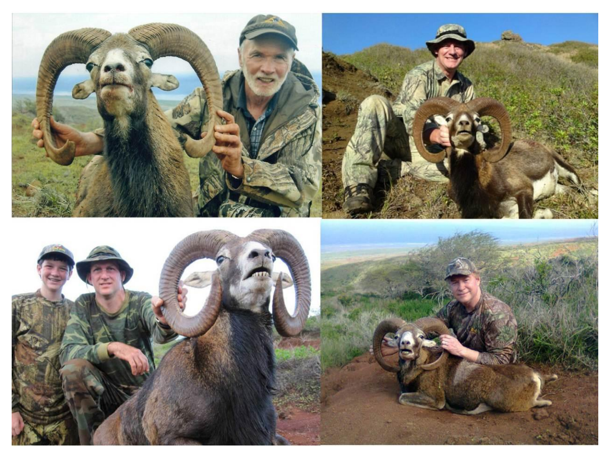
Figure 3: Lanai mouflon ram trophies.