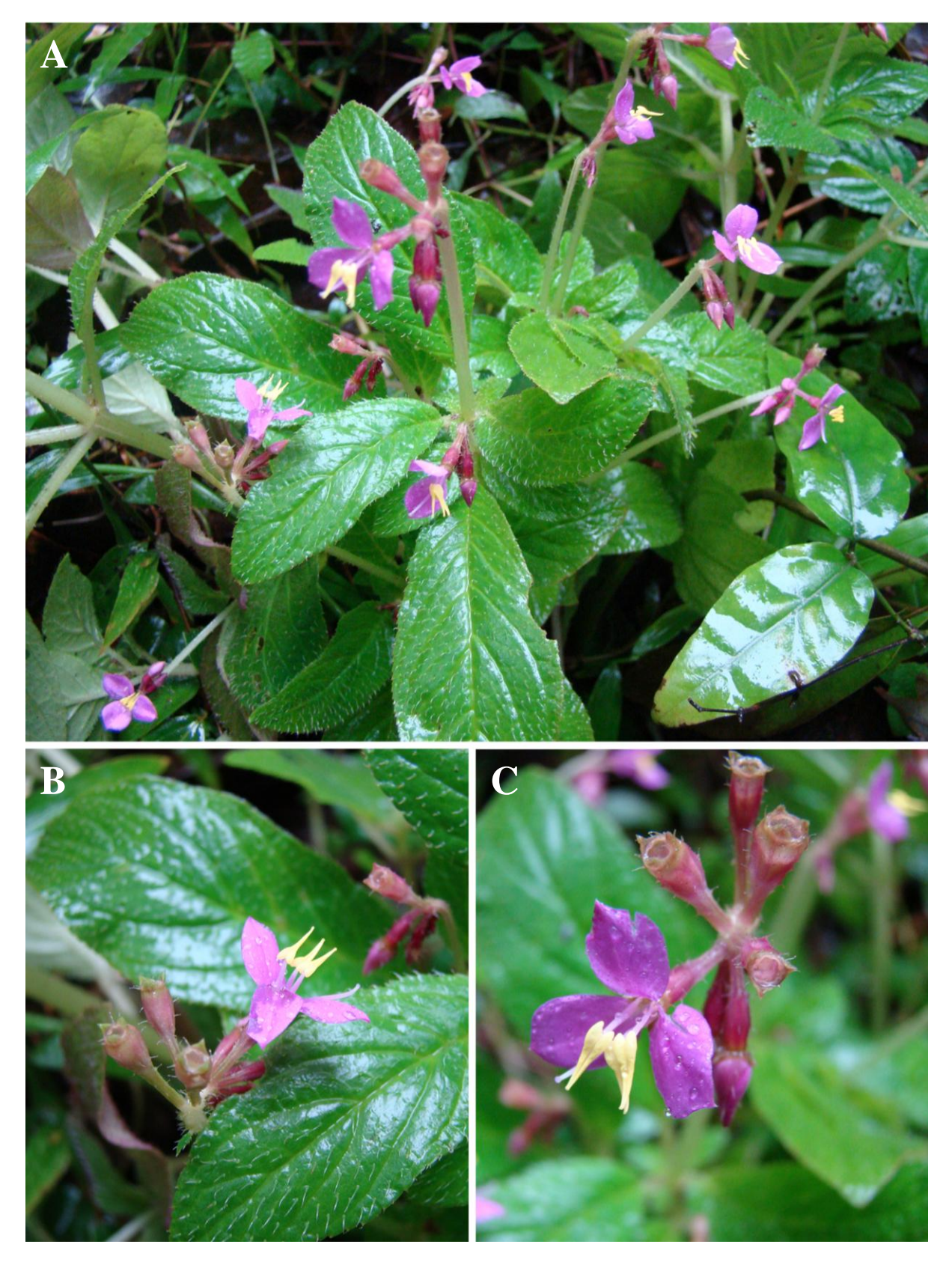
Figure 2: Sonerila keralensis sp. nov. A, View of habit; B, detail of a flower; C, Inflorescence showing two buds, a flower and four capsules.