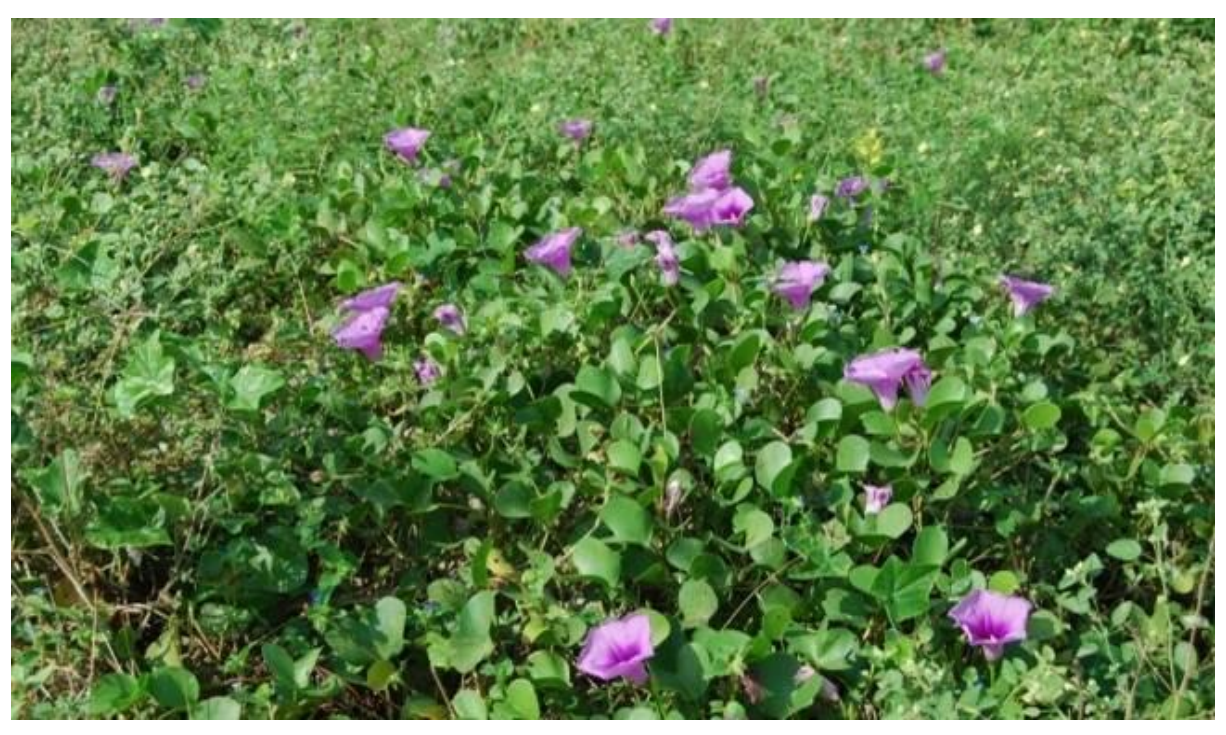
Figure 1: Ipomoea pes-caprae habit with lowering.