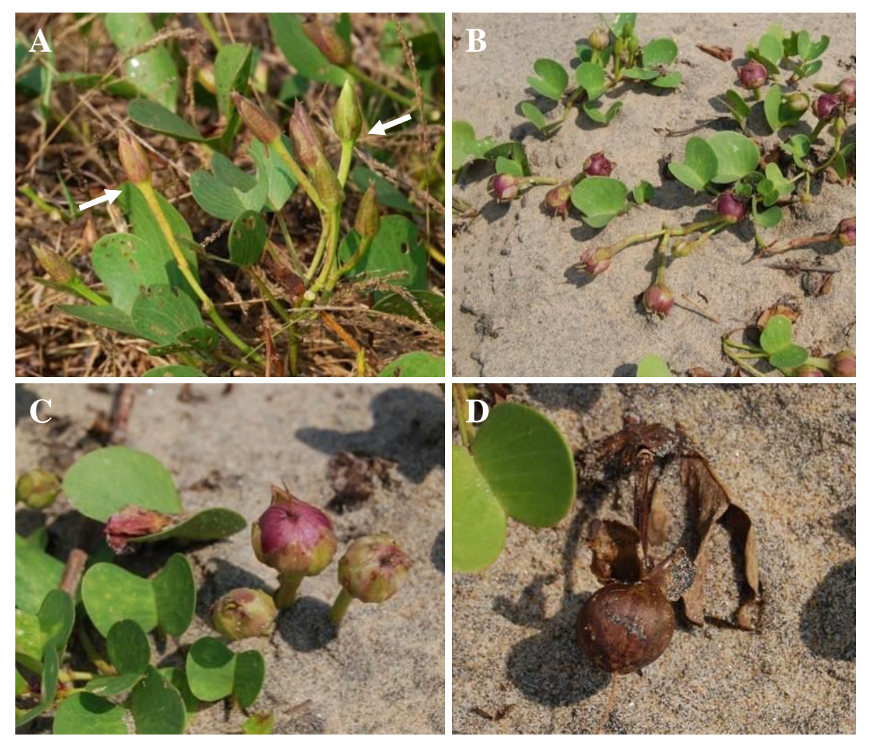
Figure 4: Ipomoea pes-caprae A , Fruit abortion (left arrow) and fruit initiation (right arrow); B , growing fruits; C , mature fruits; D , dry fruit