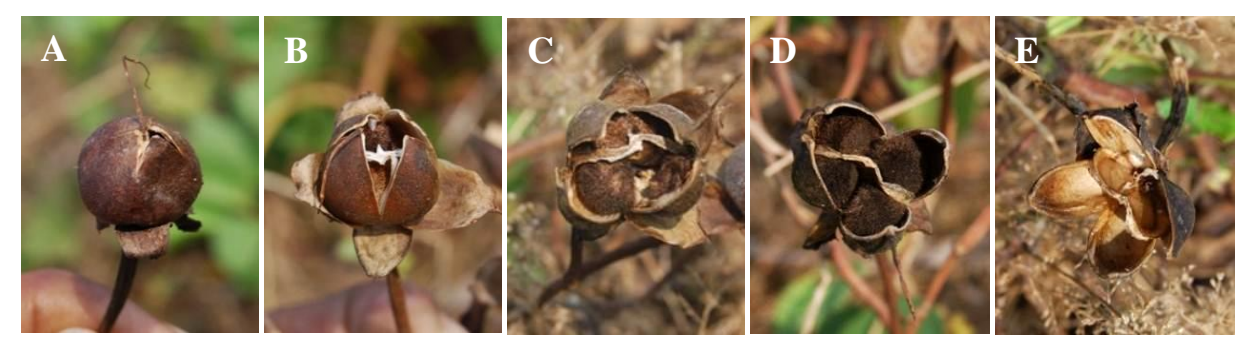
Figure 5: Ipomoea pes-caprae A-E, different stages of fruit dehiscence

Figure 4: Ipomoea pes-caprae A , Fruit abortion (left arrow) and fruit initiation (right arrow); B , growing fruits; C , mature fruits; D , dry fruit