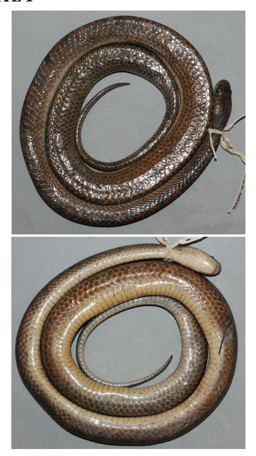
Figure 1: Dorsal (above) and ventral (below) views of the holotype (CAS 248147) of Pareas vindumi sp. nov.