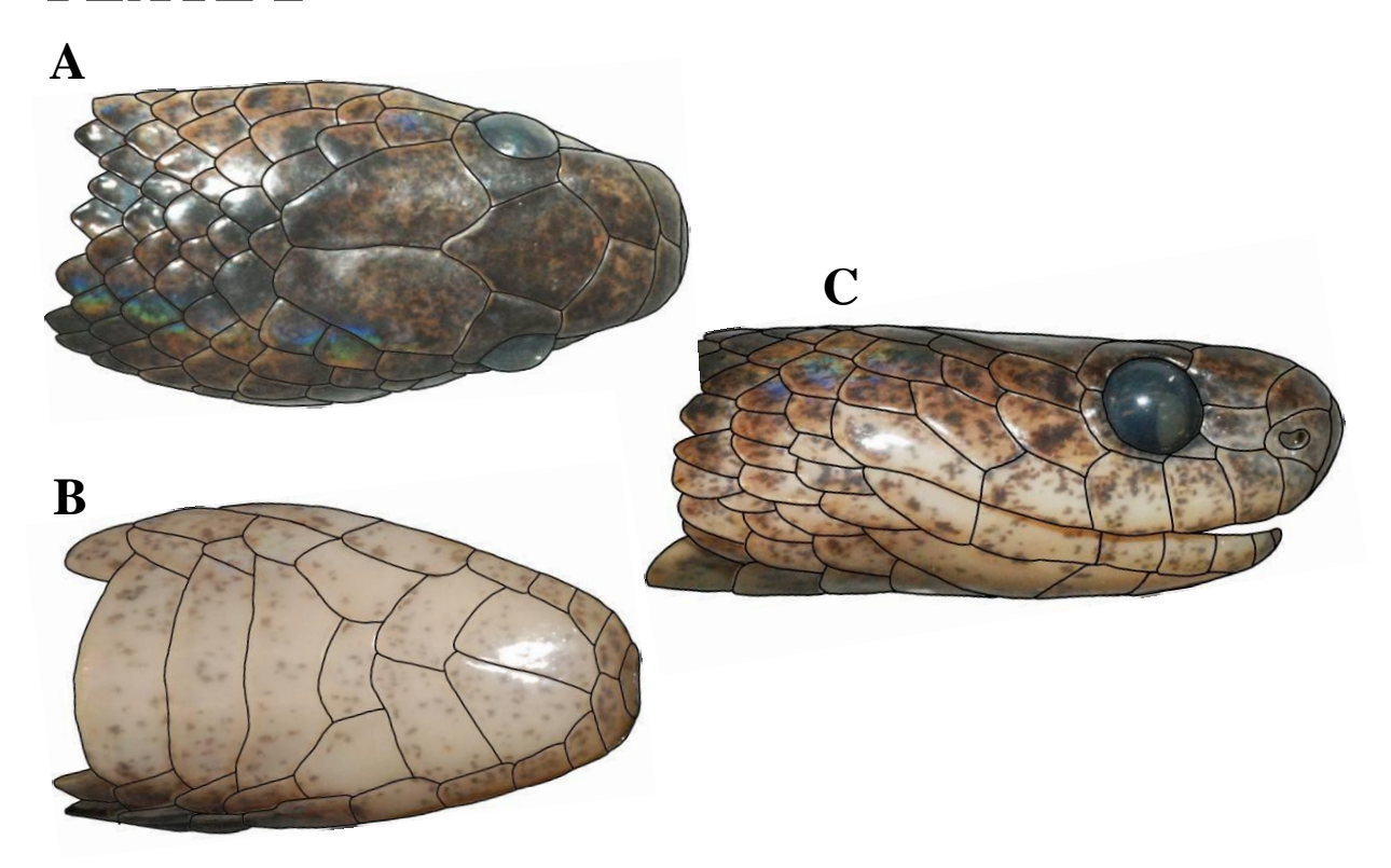
Figure 2: (A) dorsal, (B) ventral, and (C) lateral views of the head of the holotype (CAS 248147) of Pareas vindumi sp. nov.