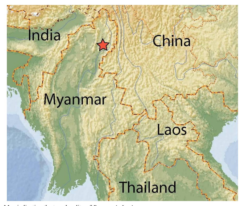
Figure 3: Map indicating the type locality of Pareas vindumi sp. nov..