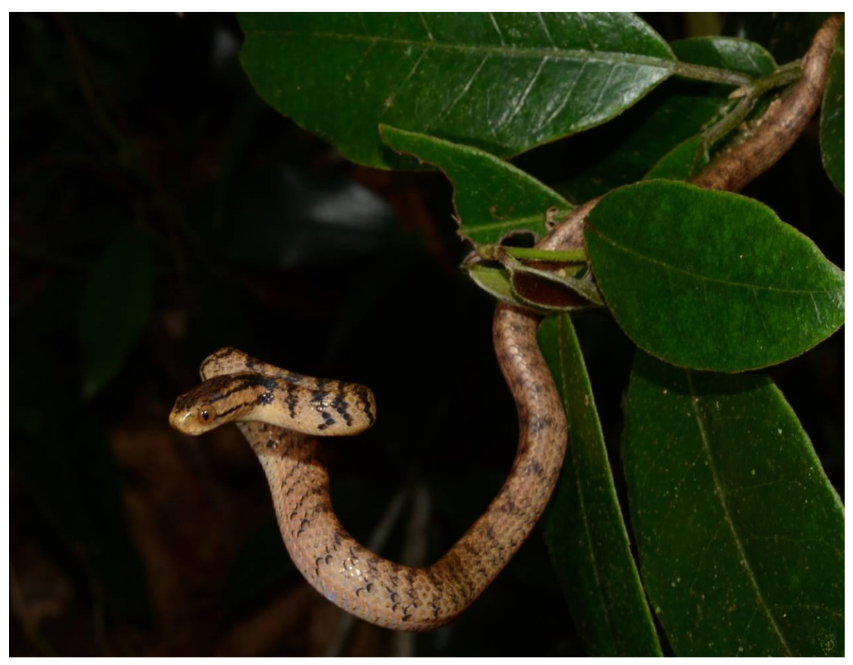
Figure 5: Live Pareas monticola, from Mizoram, India.