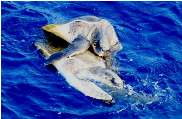
Figure 2. A breeding pair of olive ridley sea turtles ( Lepidochelys olivacea ) courtship behaviour

existing assumptions about the typical proximity of mating activities to coastal areas. The distance suggests that olive ridley turtles may engage in mating behavior in deeper, more offshore waters than previously documented, which could have important implications for our understanding of their reproductive ecology. Additionally, the observed behaviors reaffirm the complex and aggressive nature of their courtship rituals (Comuzzi & Owens 1990). Sea turtle courtship, particularly among olive ridley turtles, is often aggressive. The male frequently bites the female's neck, flippers, and tail while using his forelimb claws to grip her shell tightly. In response, the female initially resists mounting attempts by raising her body vertically, shaking vigorously, and even attempting to dislodge the male. Struggles can last for extended periods, with males sometimes competing for access to a female, leading to further aggression (Plotkin & Bernardo 2007).